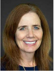
Commissioner Patty Monahan California Energy Commission